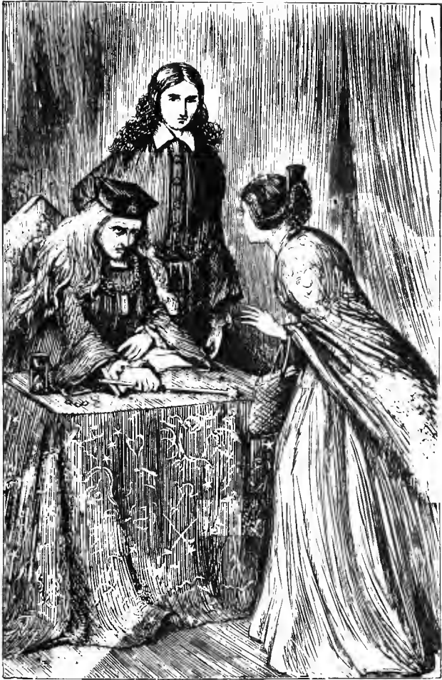
The Great Aristodemus.